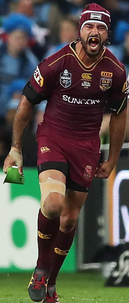
Johnathan Thurston celebrates his conversion to put the Maroons in front