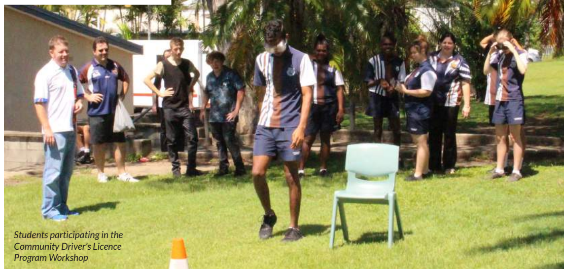
Students participating in the Community Driver's Licence Program Workshop

"Having a program like this helps me a lot because you don't have to go through everything alone."