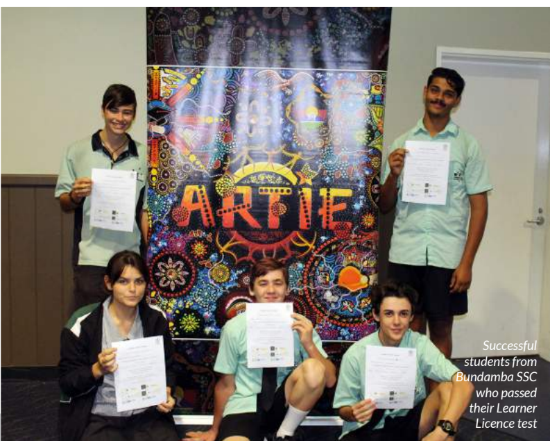
Successful students from Bundamba SSC who passed their Learner Licence test

"It is a very strong collaboration between the PCYC, FOGS and QUT. Even though it is a research project, it is also something that is highly practical because we are directly able to help these kids improve their lives.