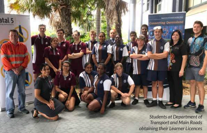
Students at Department of Transport and Main Roads obtaining their Learner Licences