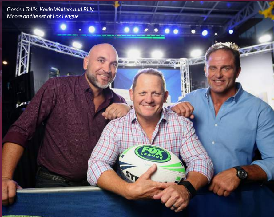
Gorden Tallis, Kevin Walters and Billy Moore on the set of Fox League

"It's been challenging and it's obviously out of my comfort zone, but it helps to have played the game. There are moments in games where you know how players are feeling because you have been in that situation yourself."