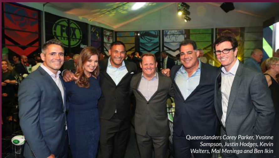
Queenslanders Corey Parker, Yvonne Sampson, Justin Hodges, Kevin Walters, Mal Meninga and Ben Ikin