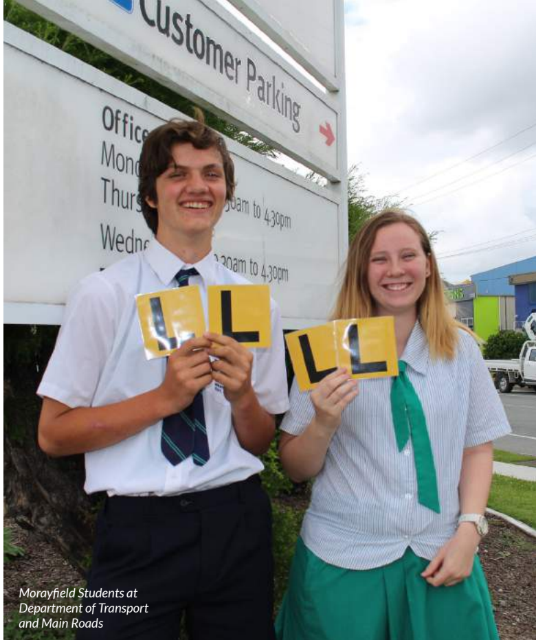
Morayfield Students at Department of Transport and Main Roads

"Having a program like this helps me a lot because you don't have to go through everything alone."